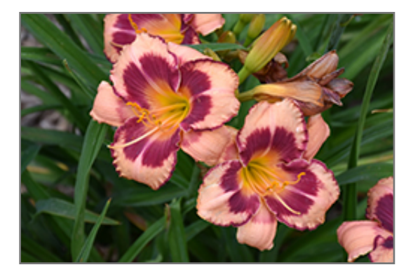
Sweet Summer Valentine Daylily flowers