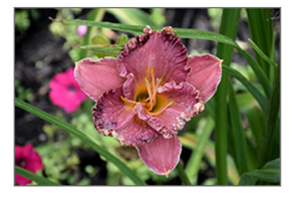
Bonibrae Royal Apparition Daylily flowers