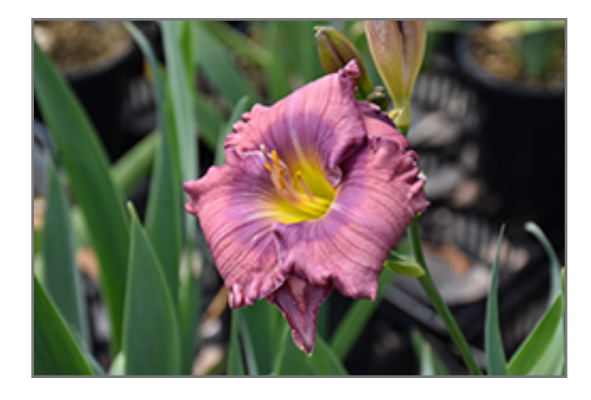
Lavender Blue Baby Daylily flowers