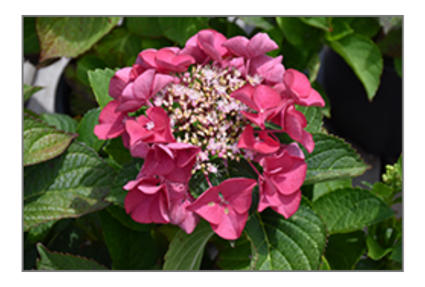
Cherry Explosion Hydrangea flowers

Cherry Explosion Hydrangea will grow to be about 4 feet tall at maturity, with a spread of 4 feet. It tends to be a little leggy, with a typical clearance of 1 foot from the ground. It grows at a fast rate, and under ideal conditions can be expected to live for approximately 20 years.