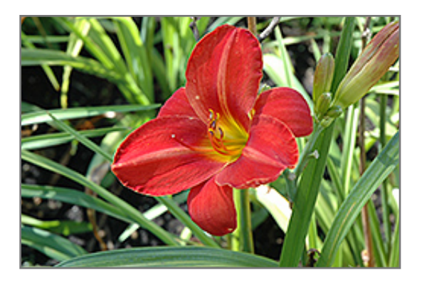
Apple Tart Daylily flowers