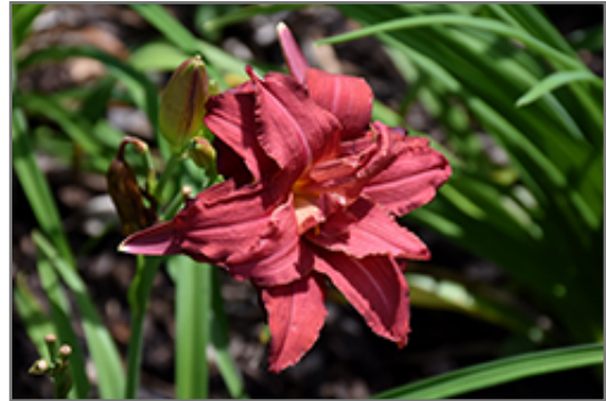
Double Pardon Me Daylily flowers