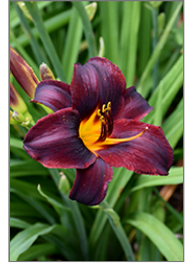
Chocolate Candy Daylily flowers

This reblooming daylily produces dark maroon trumpets with a near-black ring around a gold throat; exotic blooms that are sturdy, strong, and easy to care for; great grassy texture and form; tetraploid; good for the beginner gardener and the pro