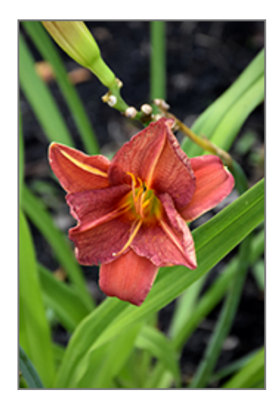
Chicago Ruby Daylily flowers