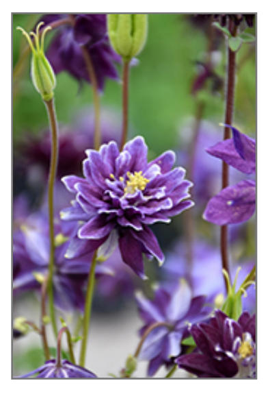
Christa Barlow Columbine flowers

A unique variation of Columbine, featuring fluffy double flowers of deep blue edged in white, on nodding stems, well above the lacy green foliage mound; wonderful for containers or border edging