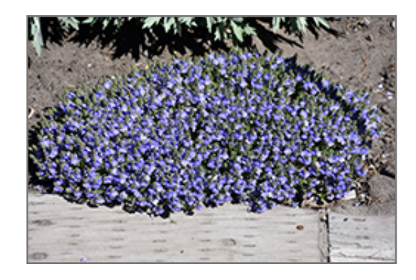
Whitley's Speedwell in bloom