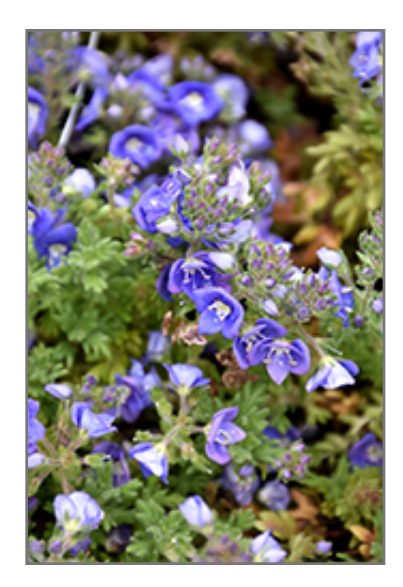
Whitley's Speedwell flowers

This is a relatively low maintenance plant, and should only be pruned after flowering to avoid removing any of the current season's flowers. It is a good choice for attracting butterflies to your yard, but is not particularly attractive to deer who tend to leave it alone in favor of tastier treats. It has no significant negative characteristics.