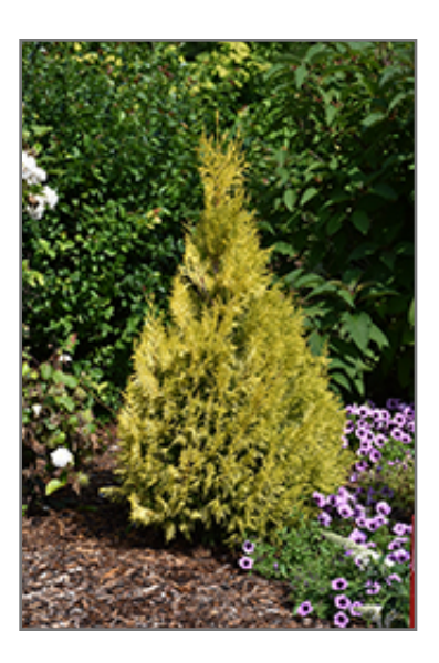
Filip's Magic Moment Arborvitae