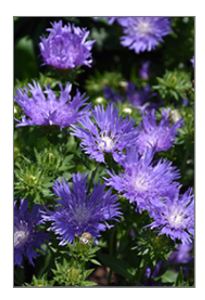
Blue Frills Aster flowers