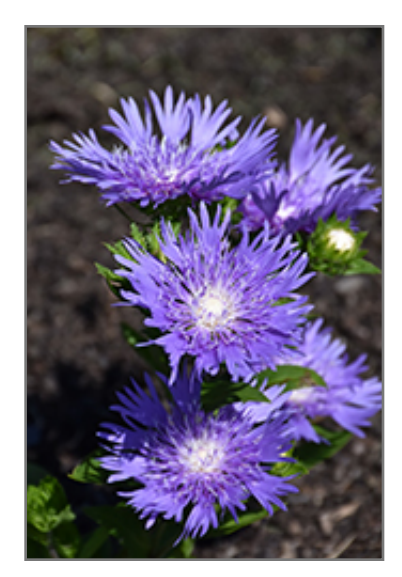
Blue Frills Aster flowers