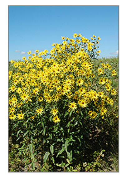
False Sunflower in bloom