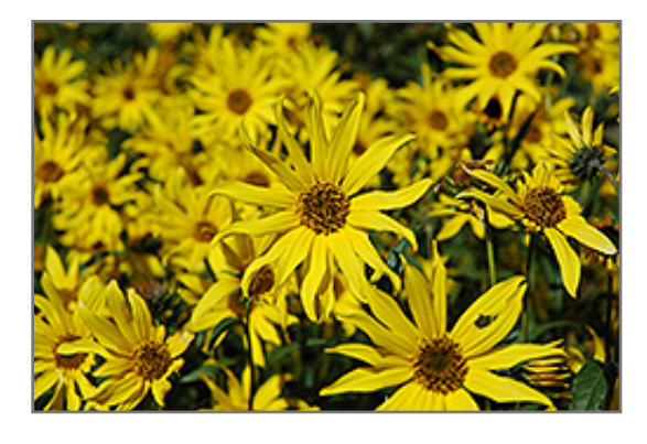
False Sunflower flowers

This is a relatively low maintenance plant, and is best cleaned up in early spring before it resumes active growth for the season. It is a good choice for attracting butterflies to your yard. It has no significant negative characteristics.