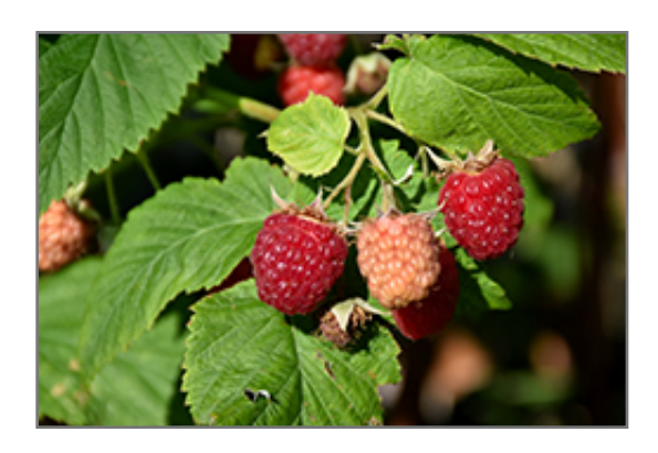
Latham Raspberry fruit

Latham Raspberry has rich green deciduous foliage on a plant with an upright spreading habit of growth. The fuzzy oval compound leaves do not develop any appreciable fall colour. It features an abundance of magnificent red berries in mid summer.