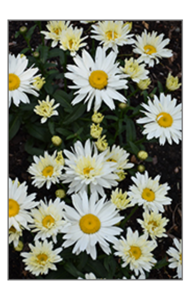
Cream Puff Shasta Daisy flowers

Cream Puff Shasta Daisy has masses of beautiful white daisy flowers with gold eyes at the ends of the stems from early to late summer, which emerge from distinctive lemon yellow flower buds, and which are most effective when planted in groupings. The flowers are excellent for cutting. Its narrow leaves remain dark green in colour throughout the season.