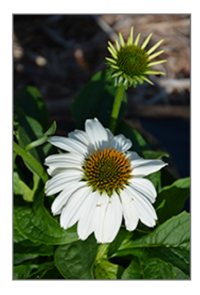
Feeling White Coneflower flowers