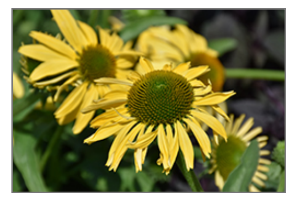
Daydream Coneflower flowers

Daydream Coneflower has masses of beautiful lightly-scented lemon yellow daisy flowers with coppery-bronze eyes at the ends of the stems from late spring to early fall, which are most effective when planted in groupings. The flowers are excellent for cutting. Its pointy leaves remain green in colour throughout the season.