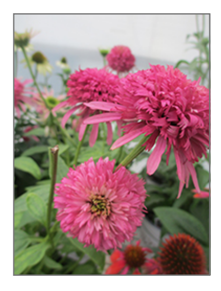
Cranberry Cupcake Coneflower flowers