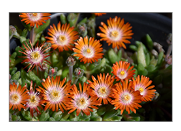
Jewel Of Desert Topaz Ice Plant flowers

A low growing carpet-like, succulent, native to South Africa but amazingly hardy in North America; dazzling orange daisy-like flowers with pale, shell pink centers and yellow eyes; perfect for xeriscapes, rock gardens, screes and sandy soils