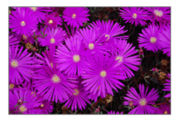
Jewel Of Desert Opal Ice Plant flowers