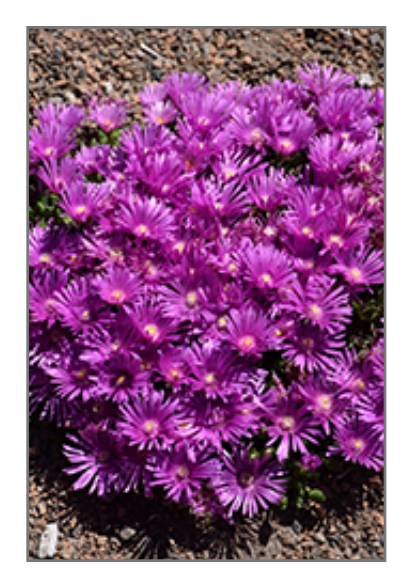
Jewel Of Desert Opal Ice Plant flowers

This is a relatively low maintenance plant, and is best cleaned up in early spring before it resumes active growth for the season. It is a good choice for attracting bees and butterflies to your yard. It has no significant negative characteristics.