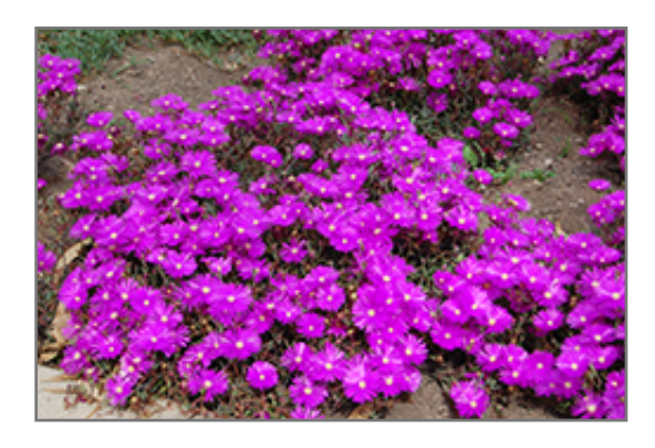
Jewel Of Desert Opal Ice Plant in bloom

Jewel Of Desert Opal Ice Plant will grow to be only 4 inches tall at maturity extending to 6 inches tall with the flowers, with a spread of 10 inches. When grown in masses or used as a bedding plant, individual plants should be spaced approximately 10 inches apart. Its foliage tends to remain low and dense right to the ground. It grows at a fast rate, and under ideal conditions can be expected to live for approximately 5 years. As an evegreen perennial, this plant will typically keep its form and foliage year-round.