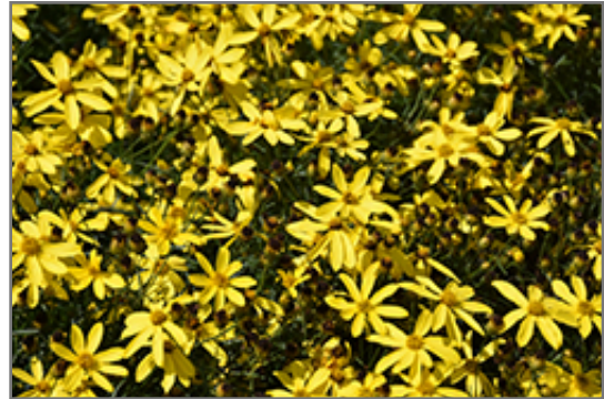
Mayo Clinic Flower Of Hope Tickseed flowers

Mayo Clinic Flower Of Hope Tickseed is recommended for the following landscape applications;