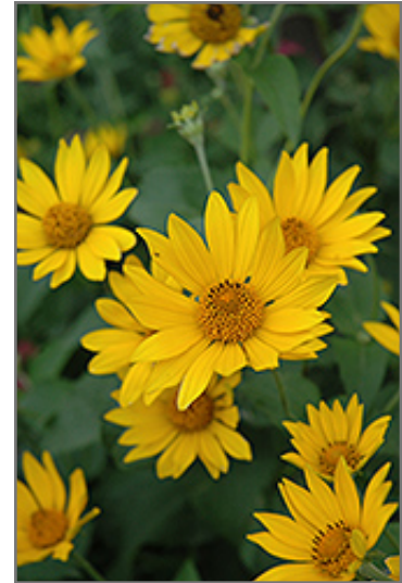
Hohlspiegel False Sunflower flowers

This is a relatively low maintenance plant, and is best cleaned up in early spring before it resumes active growth for the season. It is a good choice for attracting butterflies to your yard. It has no significant negative characteristics.