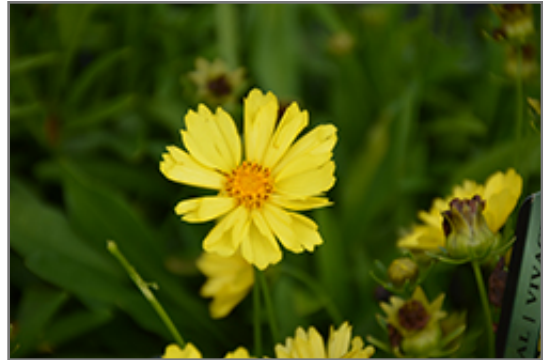
Leading Lady Sophia Tickseed flowers

Leading Lady Sophia Tickseed is recommended for the following landscape applications;