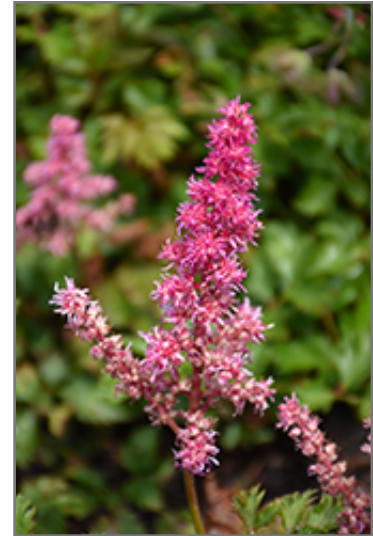
Rise And Shine Astilbe flowers