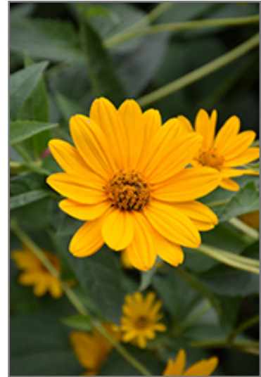
False Sunflower flowers

This is a relatively low maintenance plant, and is best cleaned up in early spring before it resumes active growth for the season. It is a good choice for attracting butterflies to your yard. It has no significant negative characteristics.