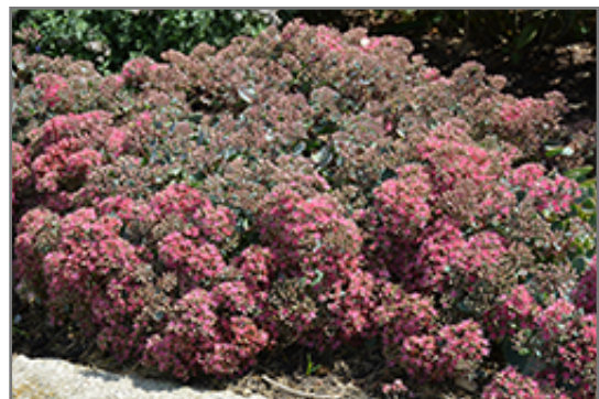
Popstar Stonecrop in bloom