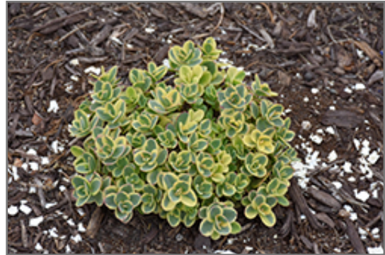
Lime Twister Stonecrop