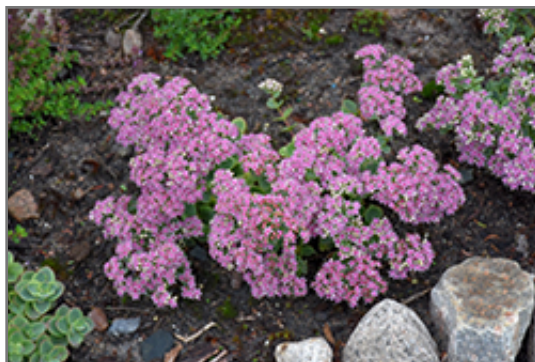
Lime Twister Stonecrop in bloom