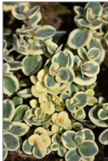
Lime Twister Stonecrop foliage

Lime Twister Stonecrop is a dense herbaceous perennial with a ground-hugging habit of growth. Its medium texture blends into the garden, but can always be balanced by a couple of finer or coarser plants for an effective composition.