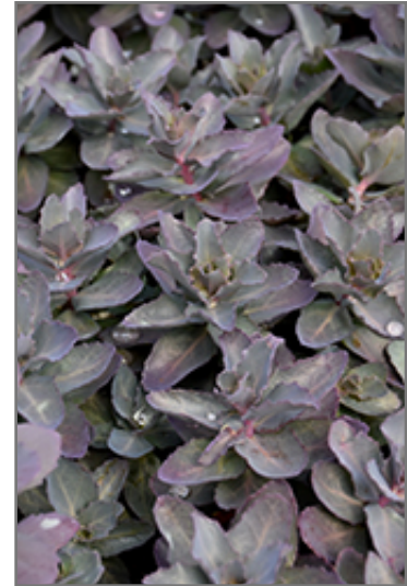
Cherry Truffle Stonecrop foliage

Cherry Truffle Stonecrop is a fine choice for the garden, but it is also a good selection for planting in outdoor pots and containers. It is often used as a 'filler' in the 'spiller-thriller-filler' container combination, providing a mass of flowers and foliage against which the larger thriller plants stand out. Note that when growing plants in outdoor containers and baskets, they may require more frequent waterings than they would in the yard or garden. Be aware that in our climate, most plants cannot be expected to survive the winter if left in containers outdoors, and this plant is no exception. Contact our experts for more information on how to protect it over the winter months.