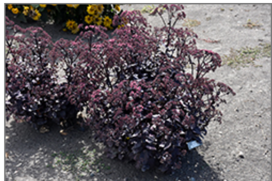
Cherry Truffle Stonecrop in bloom