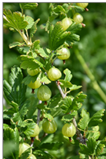
Captivator Gooseberry fruit