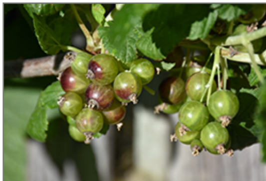
Captivator Gooseberry fruit

Captivator Gooseberry has rich green deciduous foliage on a plant with an upright spreading habit of growth. The lobed leaves turn red in fall. It features an abundance of magnificent cherry red berries in early summer, which fade to dark red over time.