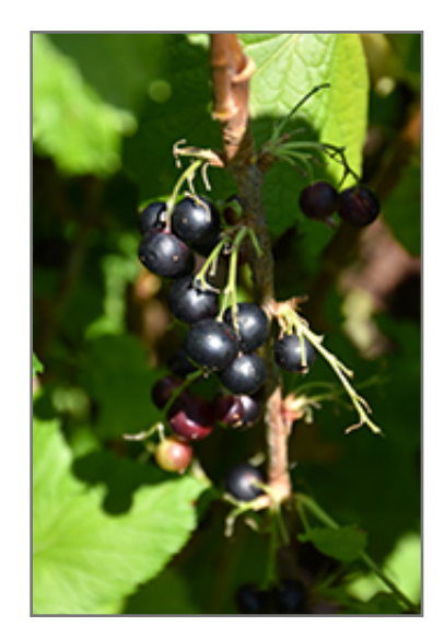
Jostaberry fruit

Jostaberry has rich green deciduous foliage on a plant with an upright spreading habit of growth. The lobed leaves turn yellow in fall. It features an abundance of magnificent plum purple berries in early summer, which fade to black over time.