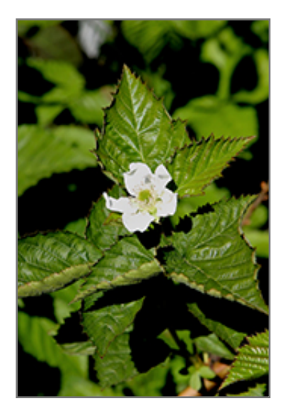
Jostaberry flowers