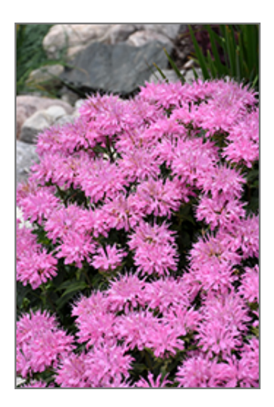
Grand Mum Beebalm flowers