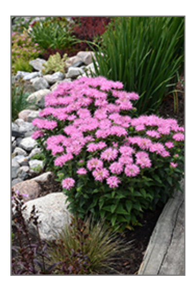
Grand Mum Beebalm in bloom