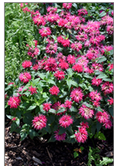
Balmy Rose Beebalm in bloom