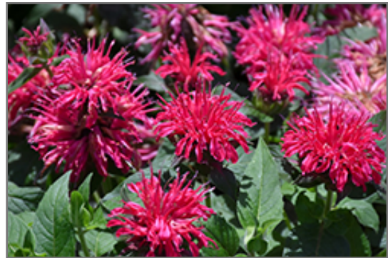
Balmy Rose Beebalm flowers