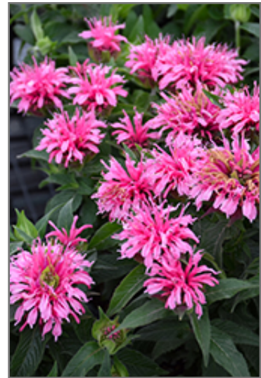
Balmy Pink Beebalm flowers

Balmy Pink Beebalm is recommended for the following landscape applications;