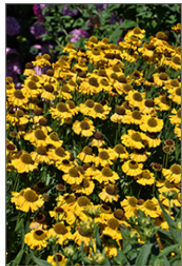
Wyndley Sneezeweed flowers