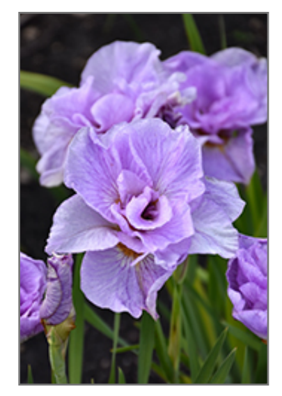
Pink Parfait Siberian Iris flowers