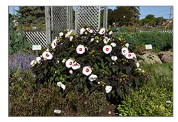
Mocha Moon Hibiscus in bloom