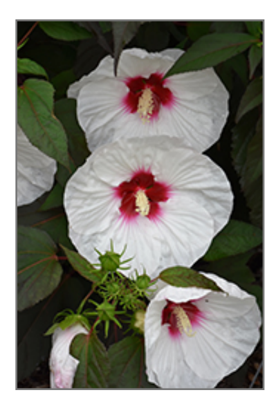
Mocha Moon Hibiscus flowers

This plant will require occasional maintenance and upkeep, and should be cut back in late fall in preparation for winter. It is a good choice for attracting butterflies and hummingbirds to your yard. Gardeners should be aware of the following characteristic(s) that may warrant special consideration;