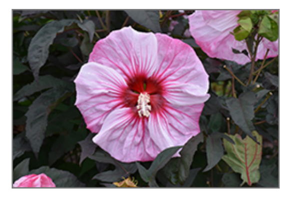
Summerific Cherry Choco Latte Hibiscus flowers

Summerific Cherry Choco Latte Hibiscus features bold white round flowers with shell pink overtones, dark red eyes and hot pink veins at the ends of the stems from mid to late summer. Its large glossy lobed leaves remain dark green in colour throughout the season.