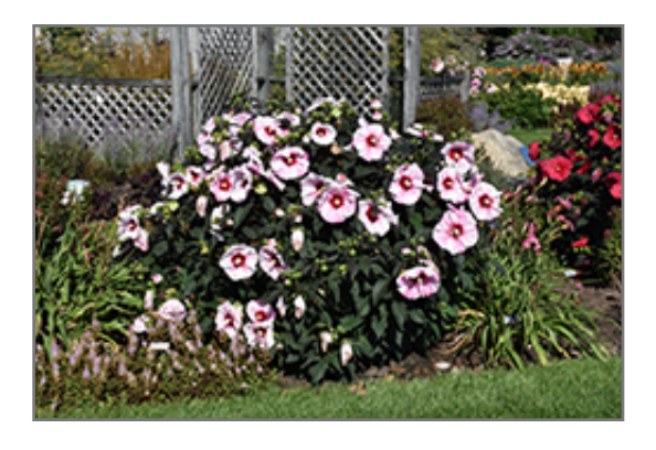
Summerific Cherry Choco Latte Hibiscus in bloom