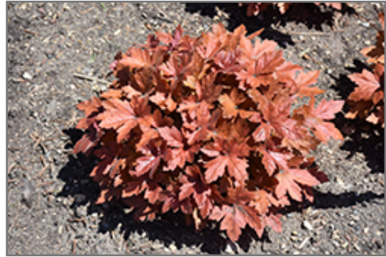
Hopscotch Foamy Bells