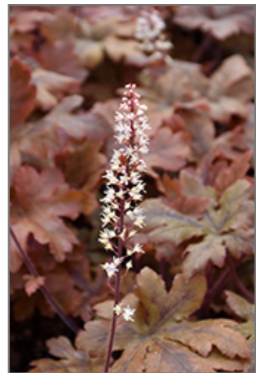
Hopscotch Foamy Bells flowers