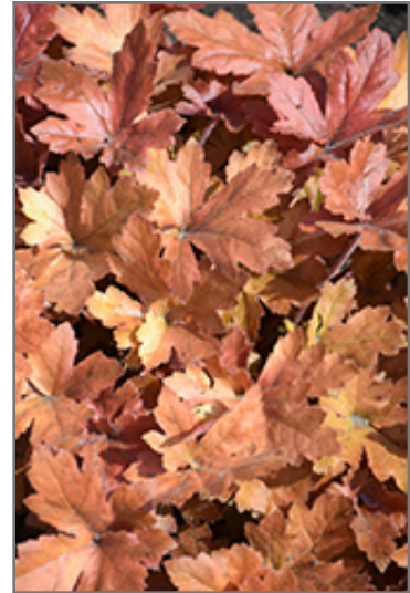
Hopscotch Foamy Bells foliage

Hopscotch Foamy Bells is a dense herbaceous evergreen perennial with tall flower stalks held atop a low mound of foliage. Its medium texture blends into the garden, but can always be balanced by a couple of finer or coarser plants for an effective composition.