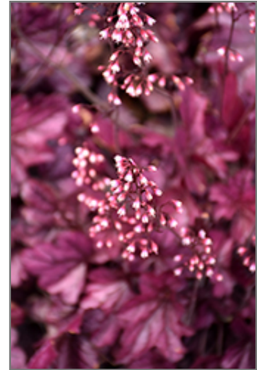
Wild Rose Coral Bells flowers

Wild Rose Coral Bells is a fine choice for the garden, but it is also a good selection for planting in outdoor pots and containers. With its upright habit of growth, it is best suited for use as a 'thriller' in the 'spiller-thriller-filler' container combination; plant it near the center of the pot, surrounded by smaller plants and those that spill over the edges. Note that when growing plants in outdoor containers and baskets, they may require more frequent waterings than they would in the yard or garden. Be aware that in our climate, most plants cannot be expected to survive the winter if left in containers outdoors, and this plant is no exception. Contact our experts for more information on how to protect it over the winter months.