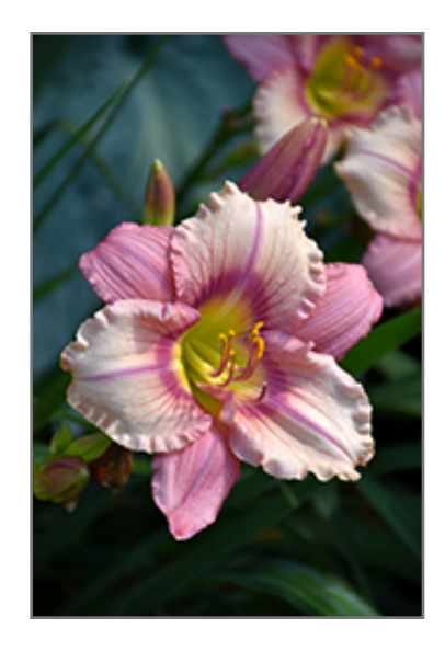
Happy Ever Appster Stephanie Returns Daylily flowers