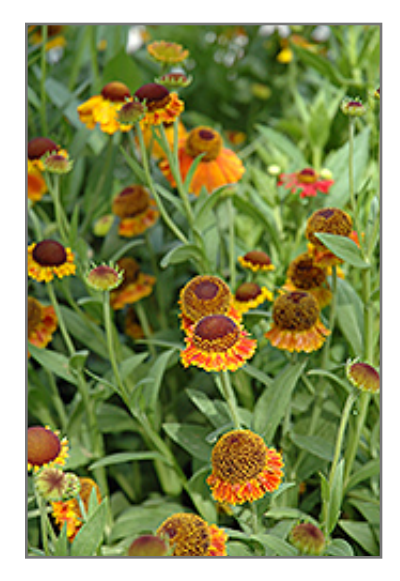
Mardi Gras Sneezeweed flowers