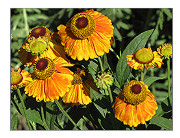
Mardi Gras Sneezeweed flowers

Mardi Gras Sneezeweed is an herbaceous perennial with an upright spreading habit of growth. Its medium texture blends into the garden, but can always be balanced by a couple of finer or coarser plants for an effective composition.