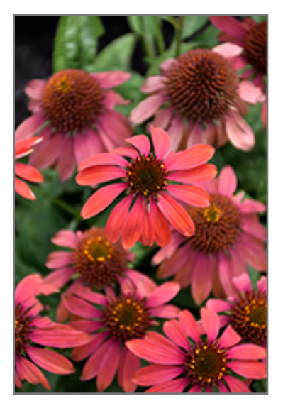
Lakota Santa Fe Coneflower flowers

Lakota Santa Fe Coneflower is an herbaceous perennial with an upright spreading habit of growth. Its medium texture blends into the garden, but can always be balanced by a couple of finer or coarser plants for an effective composition.