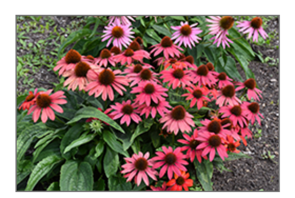
Lakota Santa Fe Coneflower flowers

This is a relatively low maintenance plant, and is best cleaned up in early spring before it resumes active growth for the season. It is a good choice for attracting butterflies to your yard, but is not particularly attractive to deer who tend to leave it alone in favor of tastier treats. It has no significant negative characteristics.