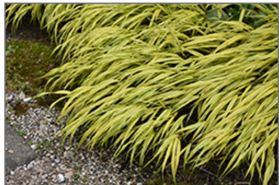
Golden Variegated Hakone Grass