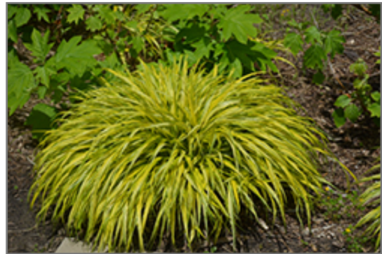
Golden Variegated Hakone Grass