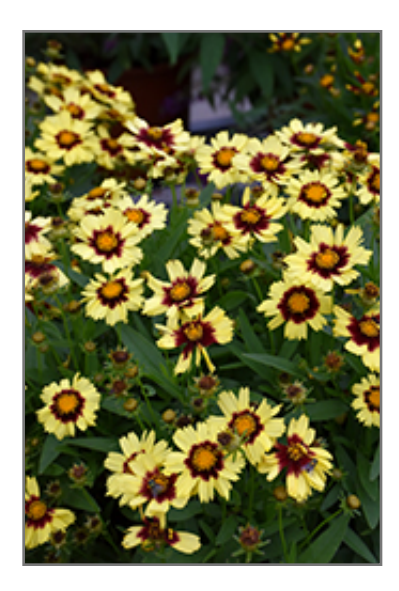
UpTick Yellow and Red Tickseed flowers