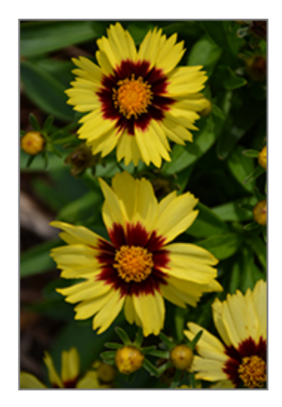
UpTick Yellow and Red Tickseed flowers