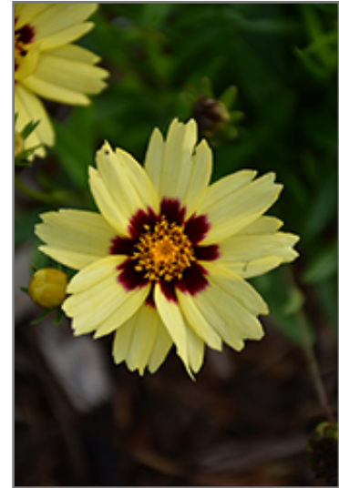
UpTick Cream and Red Tickseed flowers

UpTick Cream and Red Tickseed is recommended for the following landscape applications;