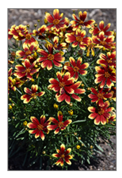
Honeybunch Red and Gold Tickseed flowers

A compact, rounded mound with cheery, daisy-like yellow flowers that have a deep scarlet ring around a central gold disk, and yellow tips; tolerant of pests and drier soils; thriving in sandy and rocky soils; needs good drainage