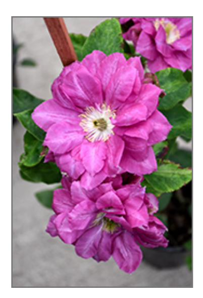
Red Star Clematis flowers