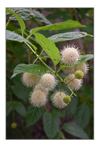
Sugar Shack Button Bush flowers