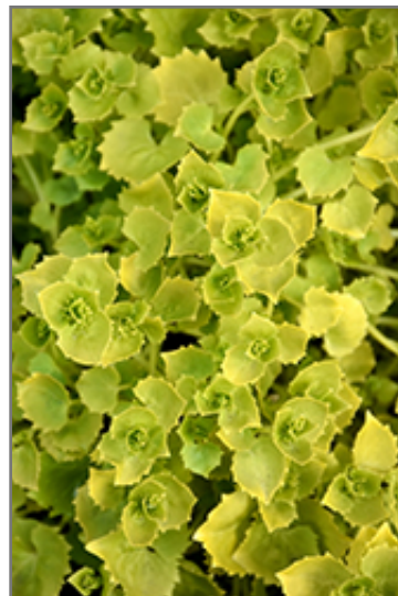
Dickson's Gold Italian Bellflower foliage