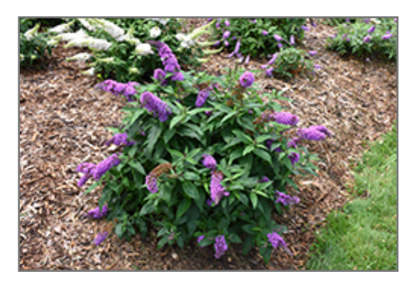
Pugster Periwinkle Butterfly Bush in bloom