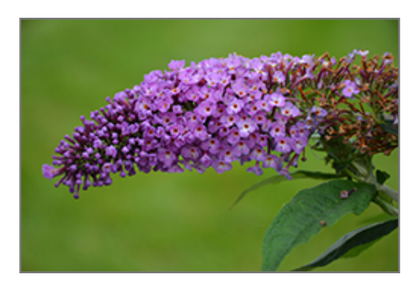
Pugster Periwinkle Butterfly Bush flowers

Pugster Periwinkle Butterfly Bush features showy panicles of fragrant lilac purple flowers with purple overtones and orange eyes at the ends of the branches from mid summer to mid fall. The flowers are excellent for cutting. It has grayish green deciduous foliage. The narrow leaves do not develop any appreciable fall colour.